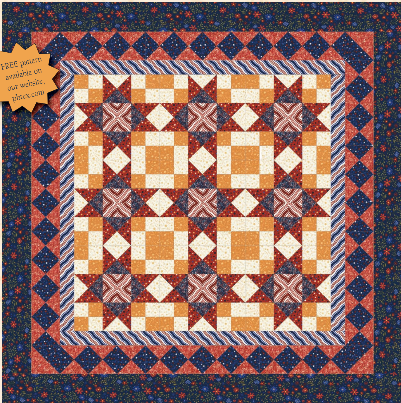
Liberty Stars quilt by Pat Sloan Size: 58" square

FREE pattern available on our website, pbtex.com