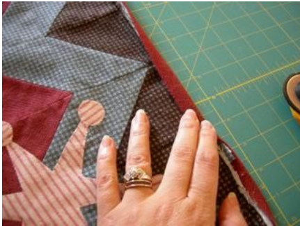
I used red thread in my top and blue thread in the bobbin so it matched the fabric.