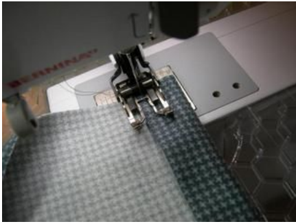
Using your walking foot, sew the flap down close to the fold