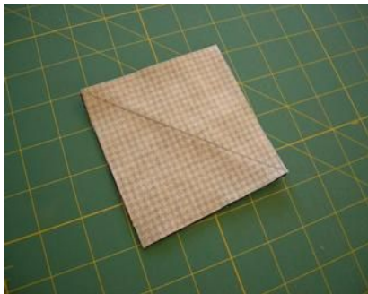
Draw a diagonal line