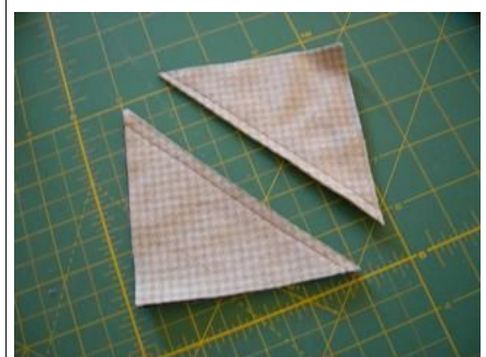
Cut ON the line