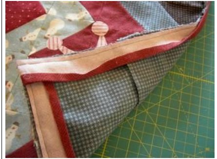
Cut your binding 1.5" wide. The flannel is thick. If doing regular cotton you can use double binding. I sew my binding on the back and pull to the front