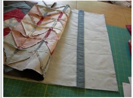
Layer the 2 backing squares wrong side facing you. Put the pillow top right side facing you.