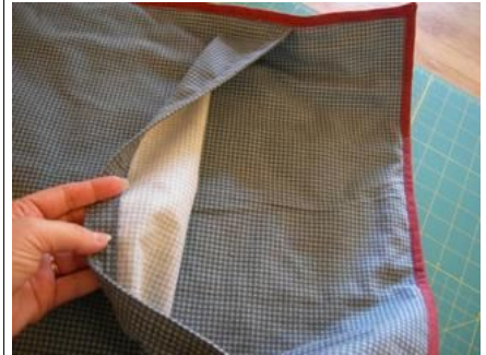
Here is the back! A nice finished edge which is wide enough so it won't open when using the pillow.