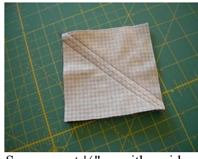
Sew a scant \frac{1}{4} " on either side of the line