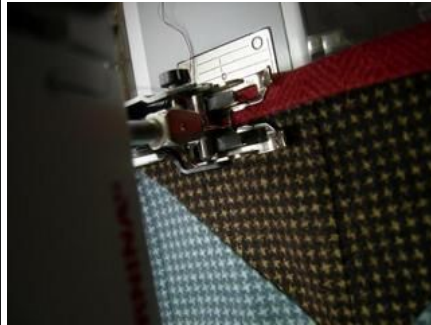
Reverse your machine's blanket stitch and sew down the binding with your blanket stitch or other decorative stitch