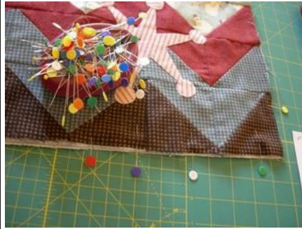
I pinned a bit to hold it together for binding the edge