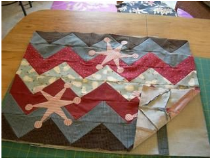
Make sure the pillow top and backing pieces are lined up