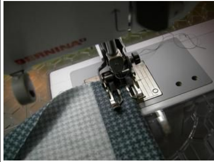
To make the edge nice I top stitch close to the outside.