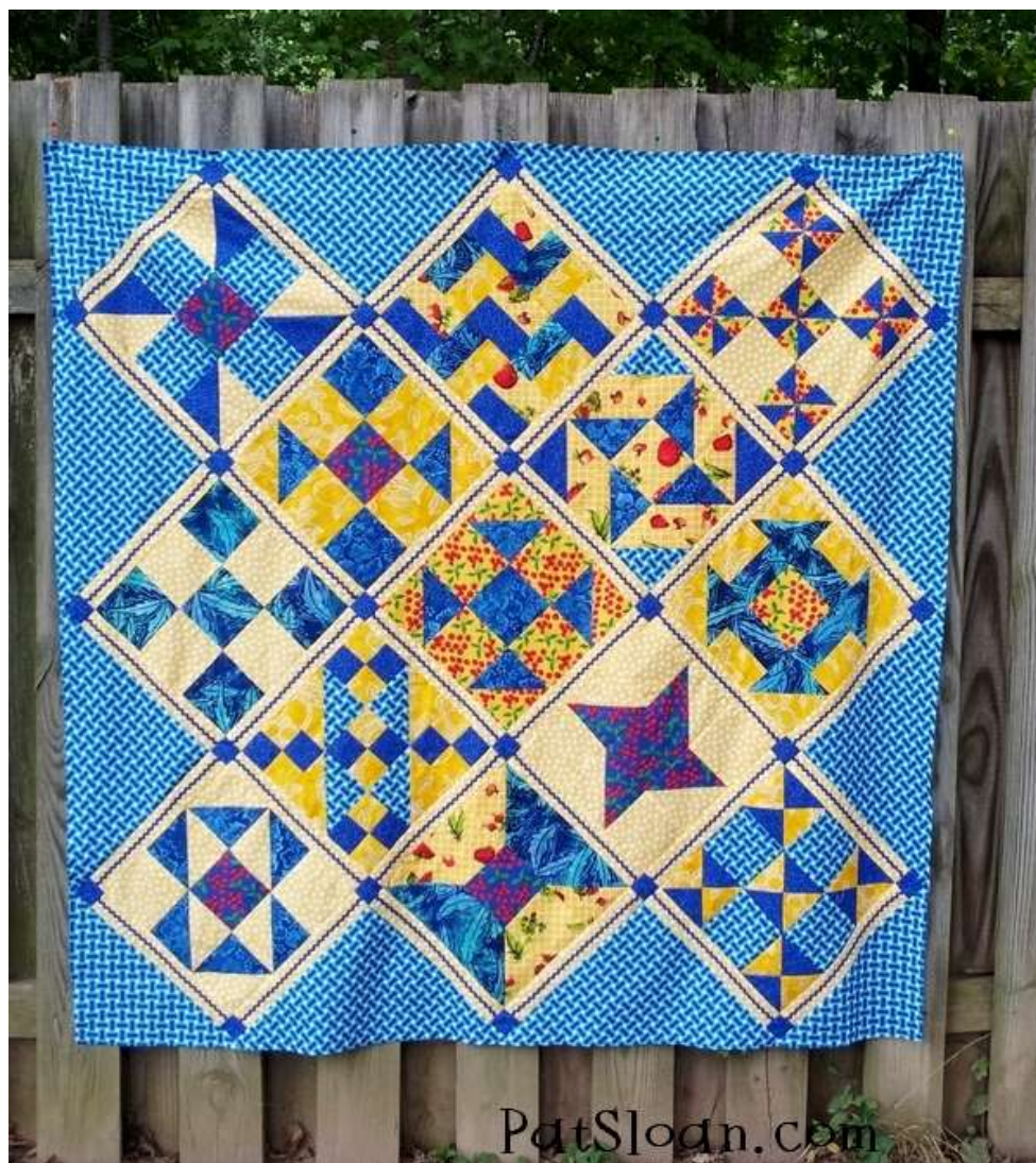
PatSloan.com Approx "59 x 59" quilt

http://quiltinggallery.com/learning-center/beginners-quilt-along/