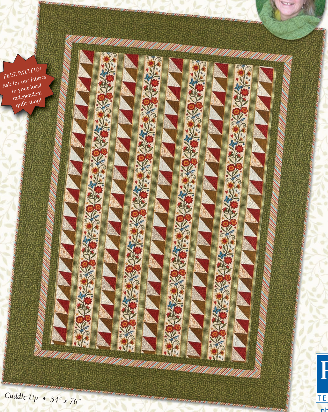
Cuddle Up • 54" x 76"

FREE PATTERN Ask for our fabrics in your local independent quilt shop!